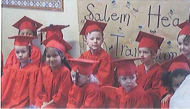
Salem (Siletz) Tribal Head Start (pm class)