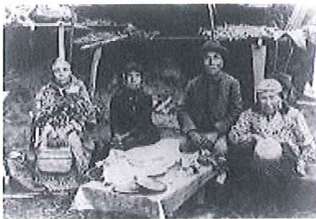
Culture Camp July 12 th 13 th 14 th