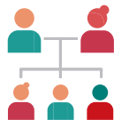
FAMILY HISTORY OF TYPE 2 DIABETES