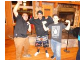
Photo of Tribal youth at our 2017 Youth Conference.

Couples counseling, adventure-based therapy, youth, adult and family counseling with emphasis in experiential healing and person-centered therapy.