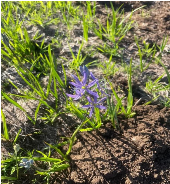
Beautiful Native Camas plant Photo taken at the Siletz Farm & Garden Property